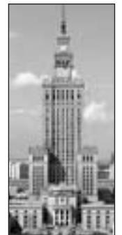
The Palace of Culture and Science in Warsaw: Site for WCF IV